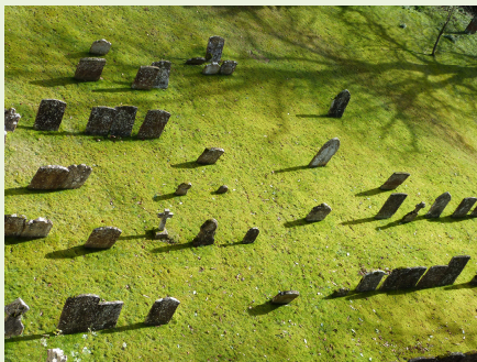
View from the tower