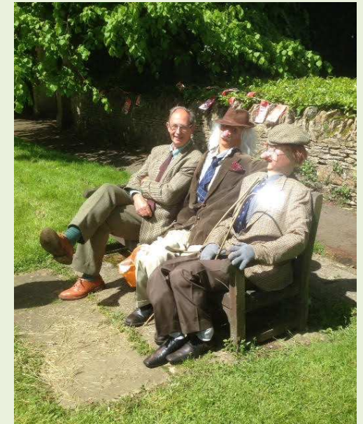
Church fete scarecrow competition