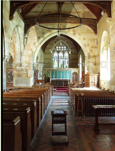
Duns Tew aisle