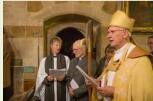
The Rector's induction, Oct 2018, with the Bishop of Dorchester